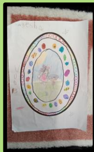
Ayesha – PM Nursery