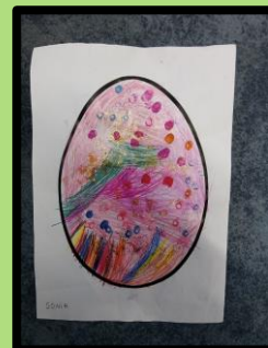
Sonia – FT Nursery