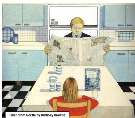
Taken from Gorilla by Anthony Browne

Remember, a little reading goes a long way! (even if it is only a page)