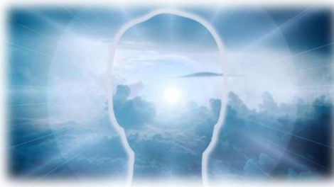
Ideas about the Soul