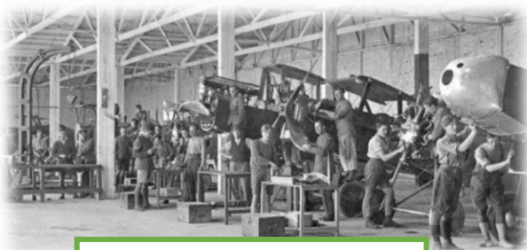
Aircraft workers in 1917