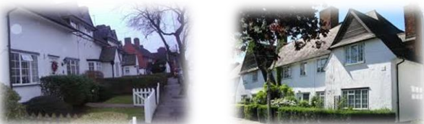
Cottages in Roe Green Village