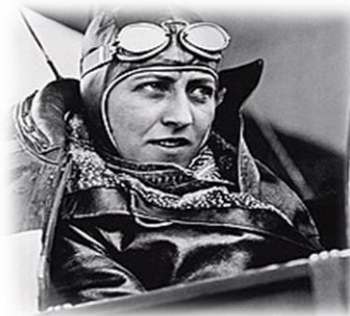
Amy Johnson (1903-1941)