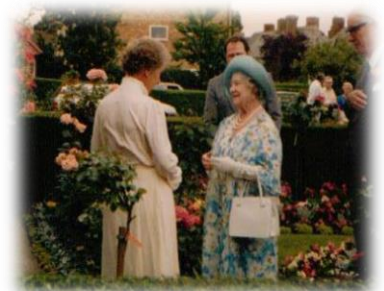
The Queen Mother, 1986